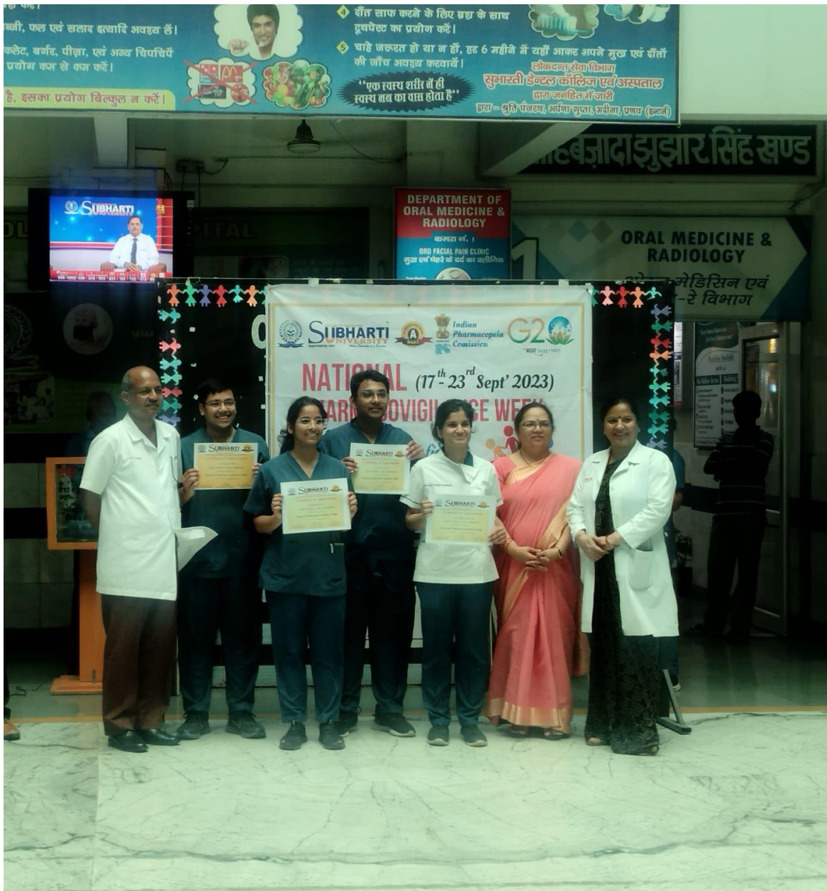
Awards to Students