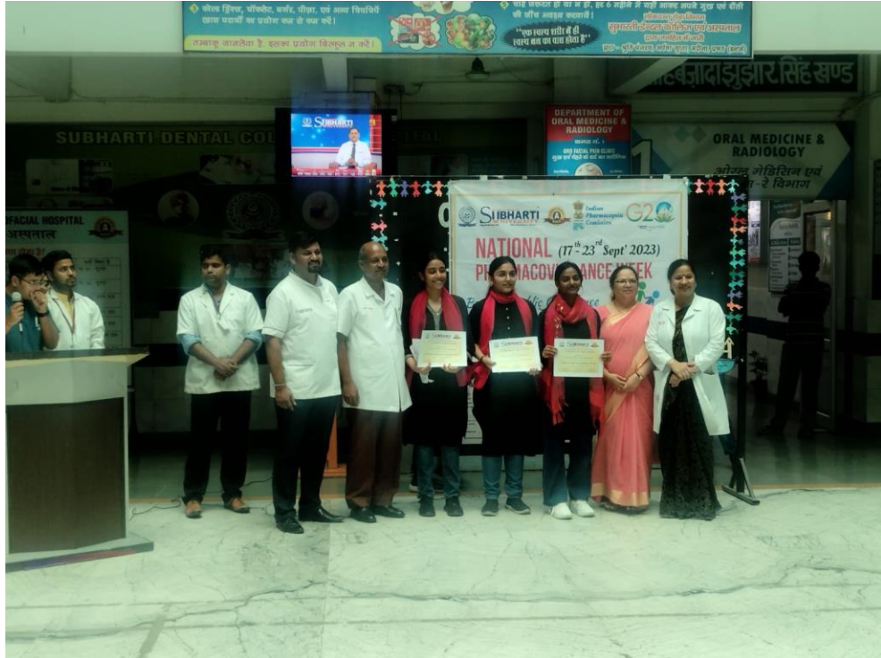
Awards to Students